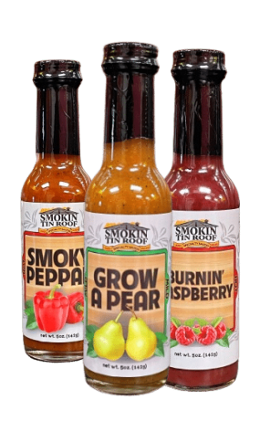
8.49 Smokin' Tin Roof Smoky Peppa, Grow a Pear & Burnin' Raspberry