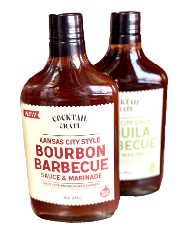
12.49 Cocktail Crate Bourbon Barbecue & Tequila Barbecue 12.7 oz.